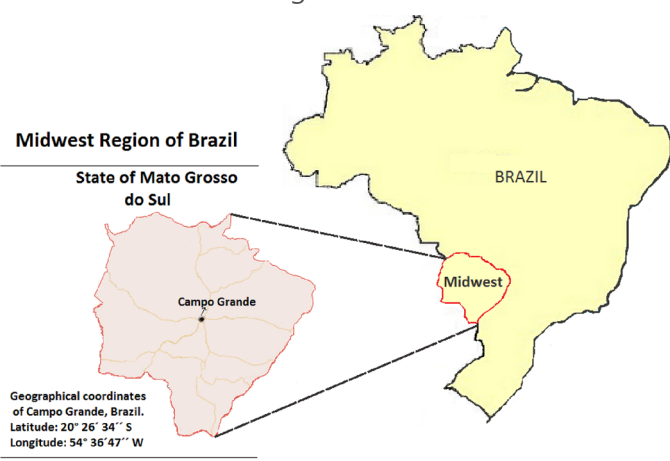
Figure 1: Geographic coordinates of Campo Grande, State of Mato Grosso do Sul, Midwest region of Brazil.